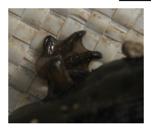
Fig 1: Webbed back feet of Smooth Newt