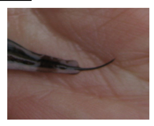
Fig.5: Truncated tail of male Palmate