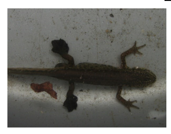
Fig. 4: Male Palmate Newt showing webbed feet