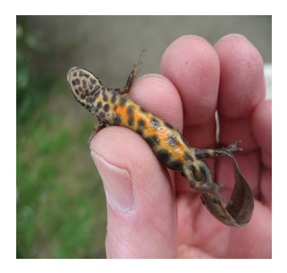
Fig 3: Belly pattern of male Smooth Newt